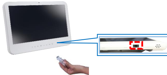
Figure 2: WMP-24F/22F/19F Series Special Option – Smart Card Reader, MSR Card Reader & Barcode Reader

In addition to the significant increase in CPU performance and new customization options, the WMP-24F/22F/19F is a continuation of the WMP series housing design. The anti-bacterial housing is effective against MRSA (staph), and the continuous use of alcohol to clean the unit will not reduce the anti-bacterial effect. In the design concept, Wincomm retains its flexible expansion slot design with a PCI-E [x16] slot. WMP-24F/22F/19F can also be equipped with a 4KV Isolation COM / LAN / USB module. Signal isolation can block noise, reduce interference, and improve the transmission quality of the signal. This can prevent damage to expensive devices and the Panel PC, as well improving the user safety.