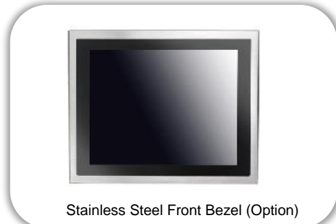
Stainless Steel Front Bezel (Option)