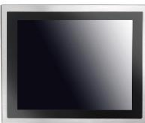
Stainless front bezel (Option)