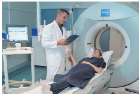
Medical Imaging Process